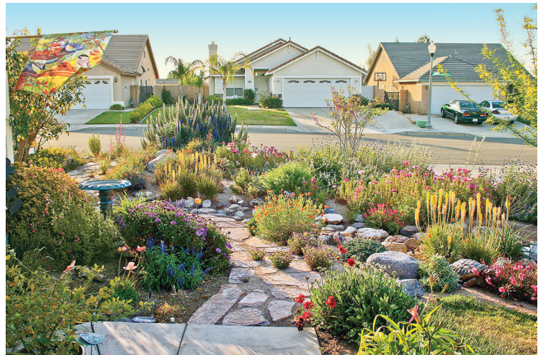
California Friendly® gardens are every bit as beautiful and not nearly as thirsty.