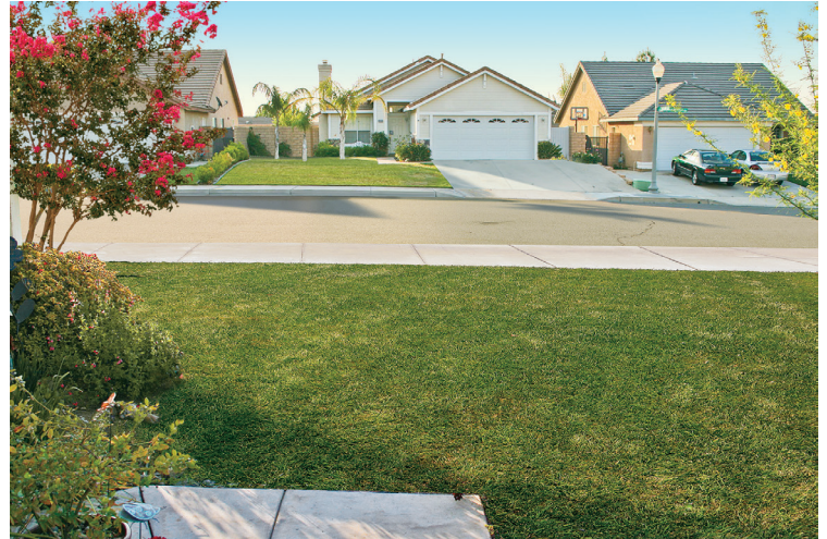
Nearly 100 million square feet of turf is planned for removal in response to doubled incentives.